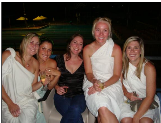
Great smiles, nice ladies, Dolphins members!