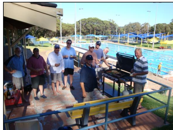
Masters' Sunday morning training session