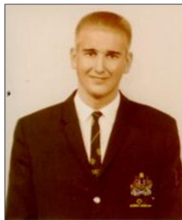
Tokyo - 1964