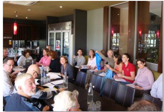
Dolphins 2008/2009 AGM

A corner throw taken from the wrong position or before the players of the attacking team have left the 2 metre area, should be retaken.